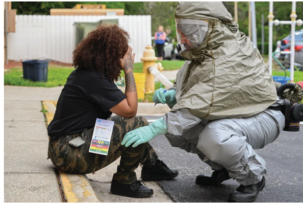
Student volunteers with mock injuries participate in the mass casualty training scenario at Parrish Medical Center.

Participates in Operation Skyfall, the Nation's Largest Medical Surge Exercise