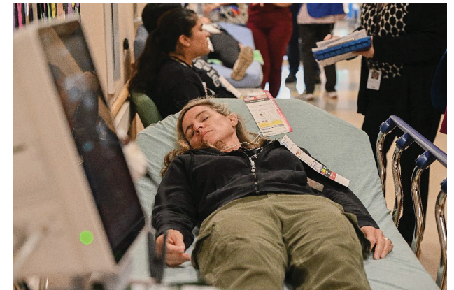
Volunteers with mock injuries participated in the mass casualty training scenario at Parrish Medical Center.